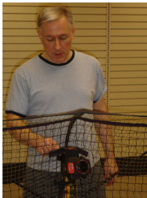
Table tennis and chess camps were added to the club's offerings in 2007 and more are planned for 2008. See write-up on p. 3.

We continue to be open five days a week in the Carrolltown Center Mall giving you plenty of opportunities to find a challenging match, take lessons from a USATT-certified coach, or just practice your strokes.